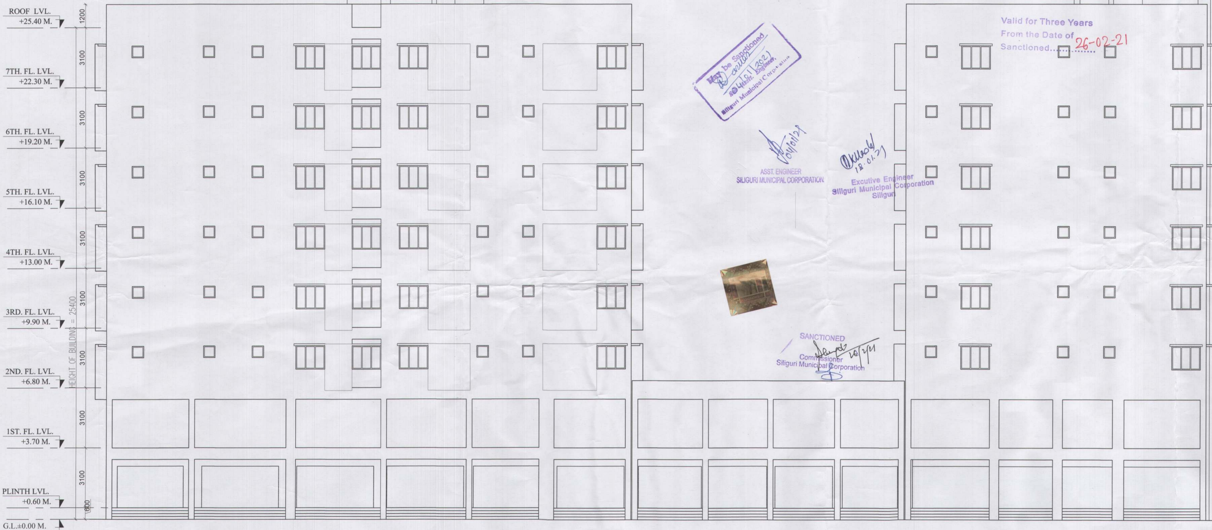
FRONT ELEVATION SCALE:1:100

PLACED IN THE BUILDING COMMITTEE MEETING HELD ON 08-10-2020 & RECOMMENDED